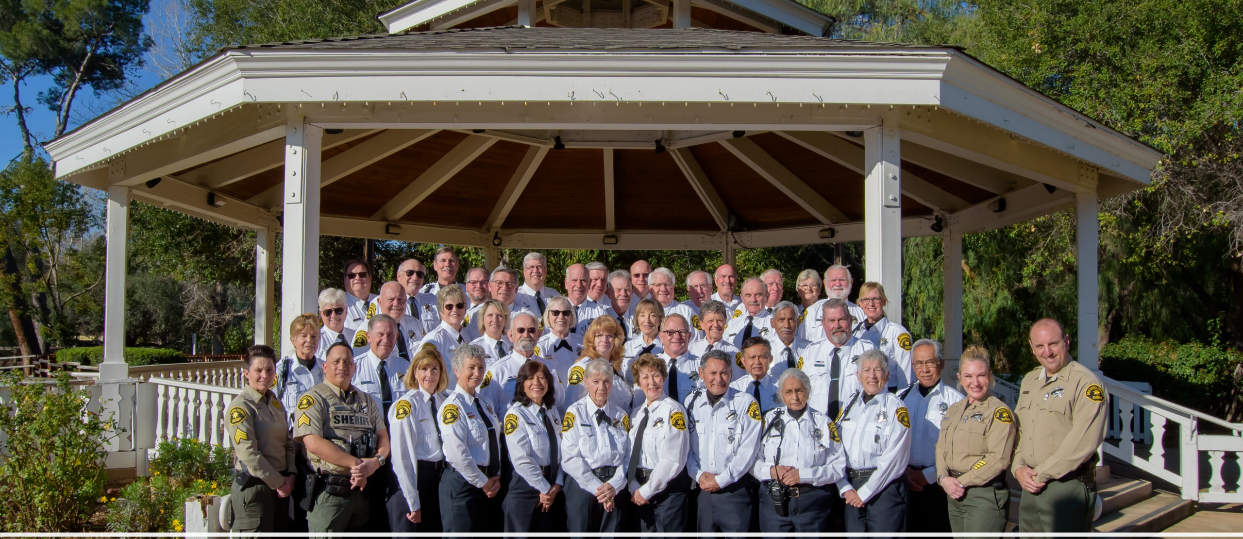
Poway Senior Volunteer Patrol (SVP)